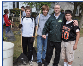
The OGSEF awarded a mini grant to its eighth-grade team to fund a day of community service at Lamb's Farm in Libertyville.